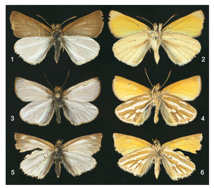
Figures 1-6. Dalla adults. 1) Dalla semiargentea, male, Colombia, 1931, dorsal surface; 2) D. semiargentea, male, same specimen as Fig. 1, ventral surface; 3) D. superargentea, holotype male, dorsal surface, data in text; 4) D. superargentea, holotype male, ventral surface; 5) D. superargentea, paratype female, dorsal surface, data in text; 6) D. superargentea, paratype female, same specimen as Fig. 5, ventral surface.

Genitalia (Fig. 10) - uncus in lateral view narrow, concave caudad of middle, strongly hooked caudad; in dorsal view narrow caudad, divided, arms parallel and closely spaced, expanding greatly cephalad to overlap large portion of tegumen as suboval plate possessing white hair tuft; gnathos shorter than uncus, narrow in lateral view, narrowing slightly caudad, interrupted by membranous area before a short sclerotized tip caudad. broad proximad in ventral view, narrowing gradually to undivided caudal end; tegumen broadly curved cephalad; combined ventral arm of tegumen and dorsal arm of saccus nearly straight; cephalic arm of saccus moderately long, thin, and curved dorsad in lateral view, cephalic end blunt in ventral view; valvae slightly asymmetrical, long (1.3 \times \text{length}) of tegumen and uncus), length about 2.6 \times width, costa concave on dorsal edge toward caudal end, ampulla elongate (longer than costa), and relatively broad (length 2.1× width), right ampulla longer and broader than left, angled dorsad, narrowing caudad to blunt caudal end, setose on both surfaces especially caudad, harpe curved dorsad and slightly inward to blunt caudal end, exceeding caudal extent of ampulla, dorsal edge finely serrate; juxta-transtilla prominent with lobate dorsal edge in lateral view, suboval in ventral view; aedeagus unadorned, moderately sinuate in lateral view, nearly straight in